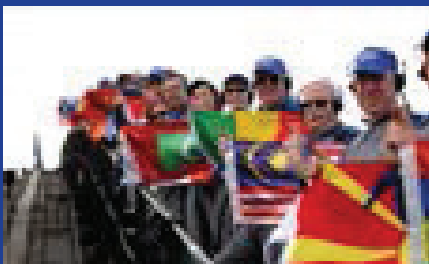
Harbour Bridge Climb