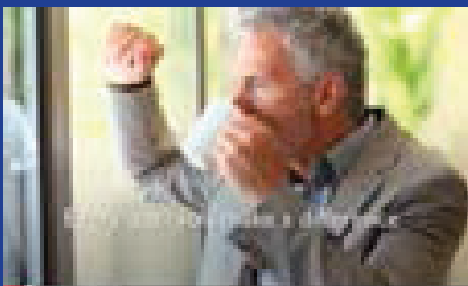
Making a difference