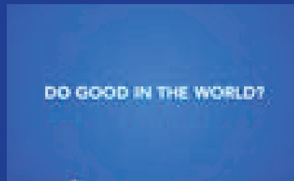
Doing Good in the World